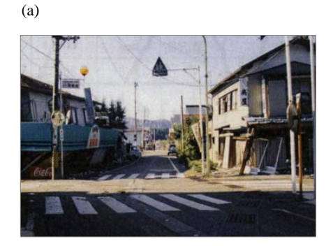
After the earthquake