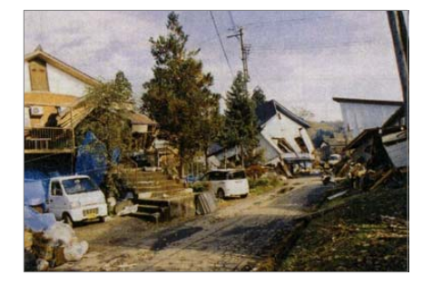
After the earthquake