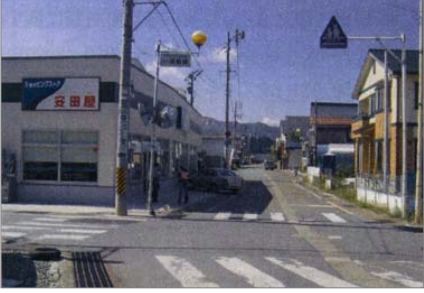
At the end of the restoration process